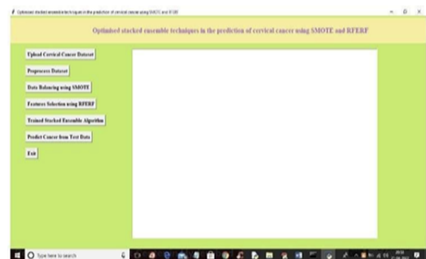
Figure 4.2 GUI of Prediction of Cervical Cancer

System implementation: GUI that is developed for the Prediction of Cervical Cancer, which consists of several functionalities is in below Figure 4.2